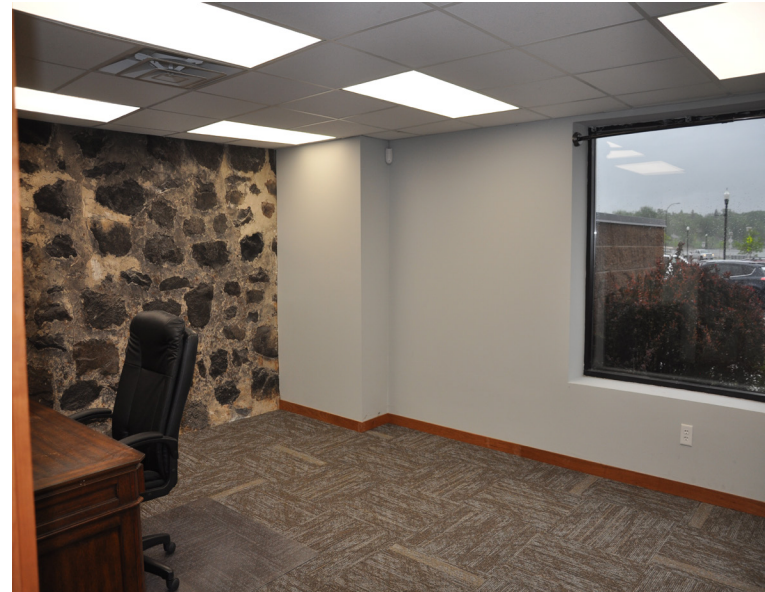
3 Private Offices, Reception Area, Windows/Natural Light