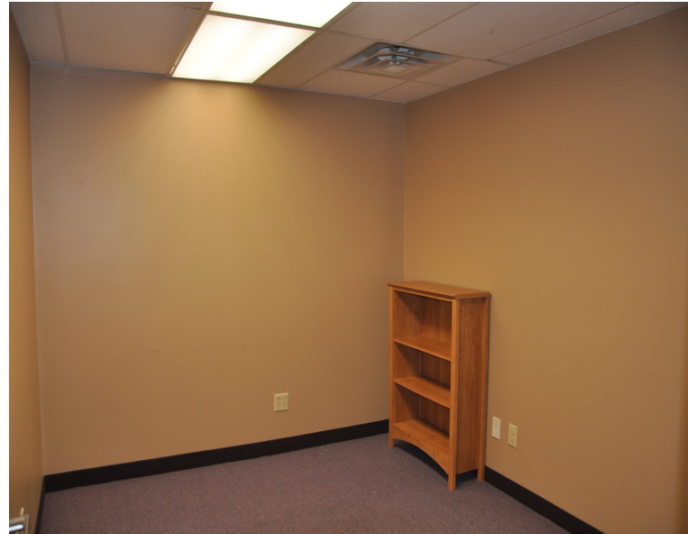
5 Private Offices, Reception Area, No Windows