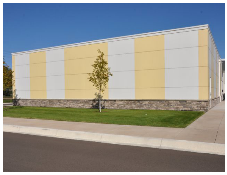
South Side of Building