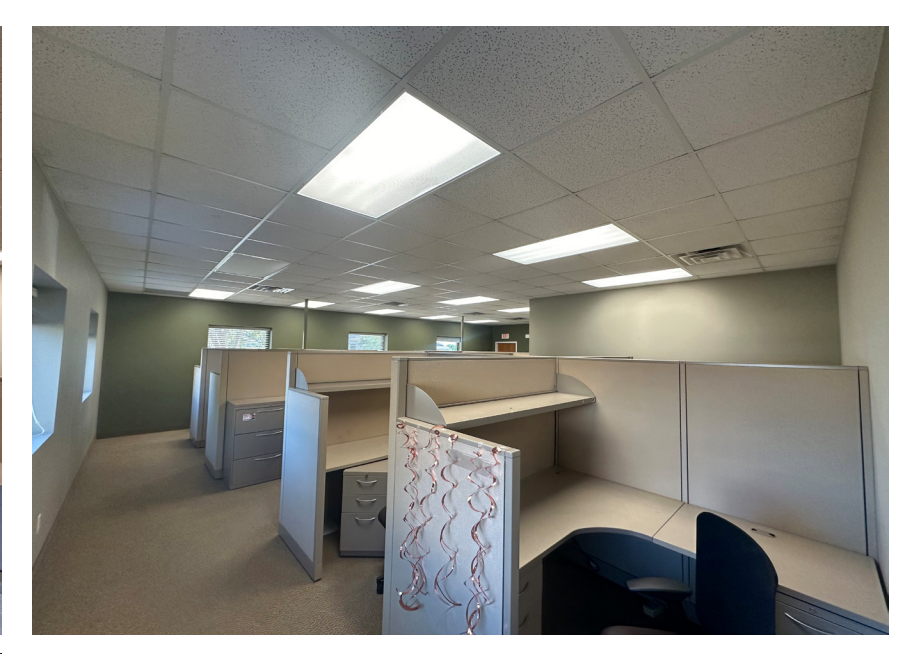
Cubicles are negotiable to stay.