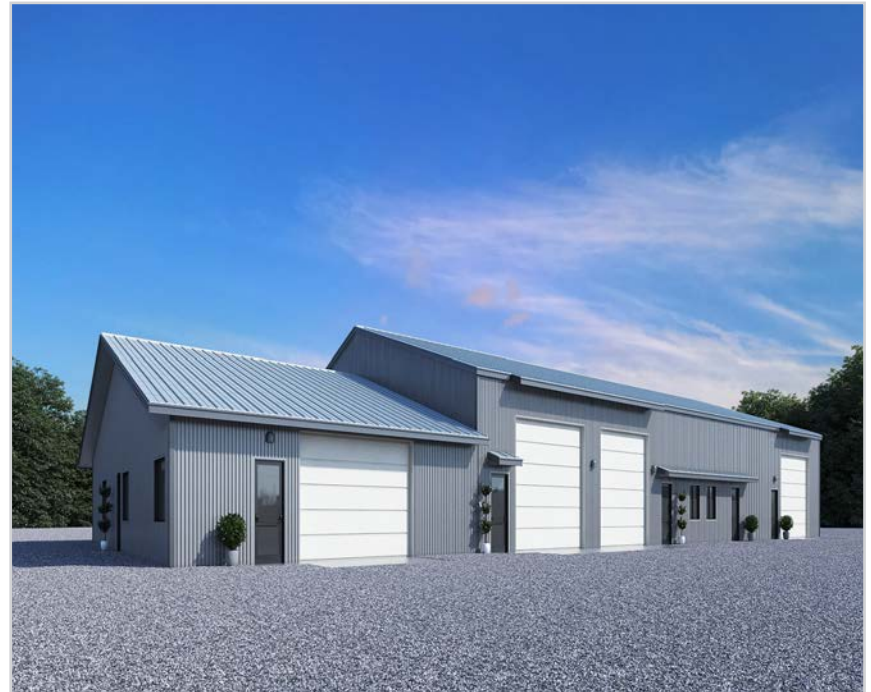
* Suites A1 - A4

This information has been secured from sources we believe to be reliable, but we make no representations or warranties explained or implied as to the accuracy of the information. Buyer must verify the information and bears all risk for any inaccuracies.