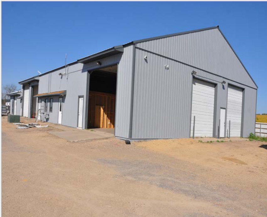
* Suites C1 - C2