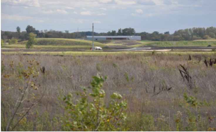
NOTE: Photo not in folder.