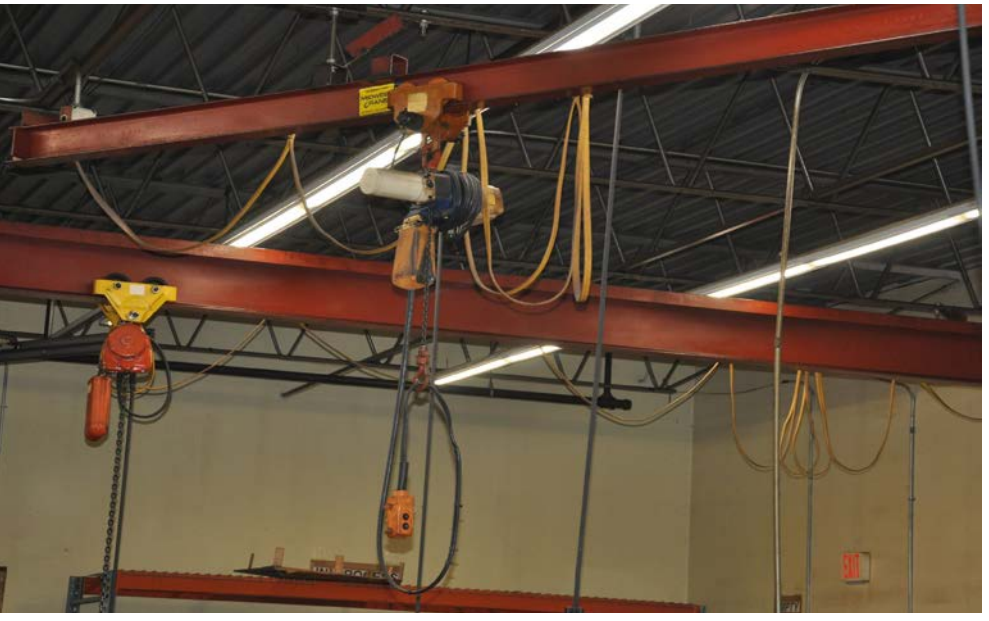
Industrial Building | 6