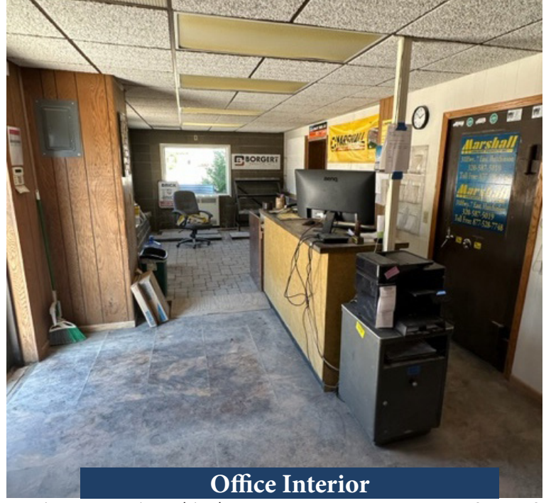
This information has been secured from sources we believe to be reliable, but we make no representations or warranties explained or implied as to the accuracy of the information. Buyer must verify the information and bears all risk for any inaccuracies.