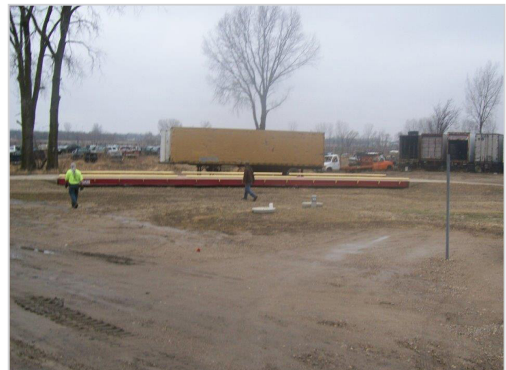
MDI Yutani MP32013