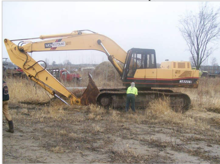
Rice Lake Truck Scale 70' (120,000 Cap)