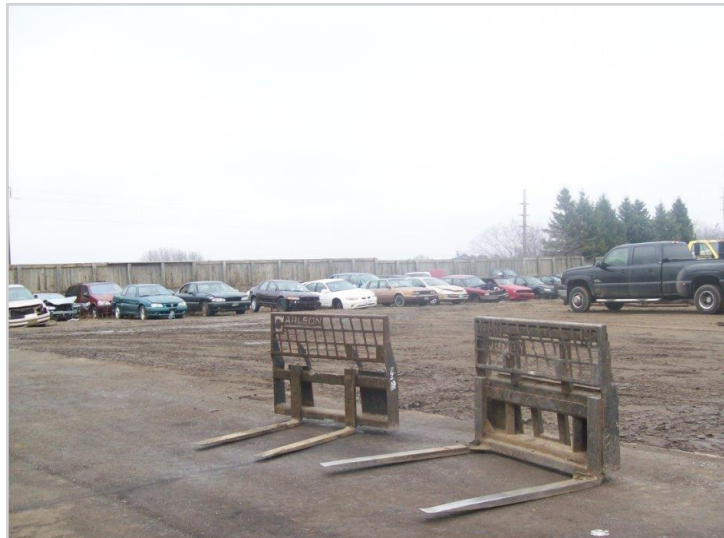
New Holland W80B Forks