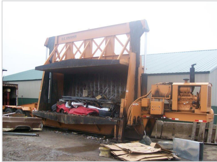
1996 EZ Crusher Model A