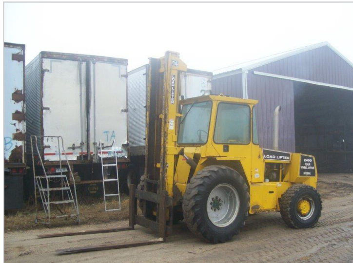
Loadlifter 2400 4-Wheel Drive