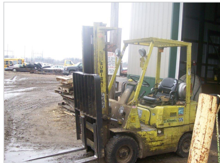
LP Forklift FG Mitsubishi Explosion Proof