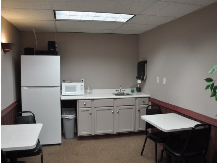
Common Area Lunchroom