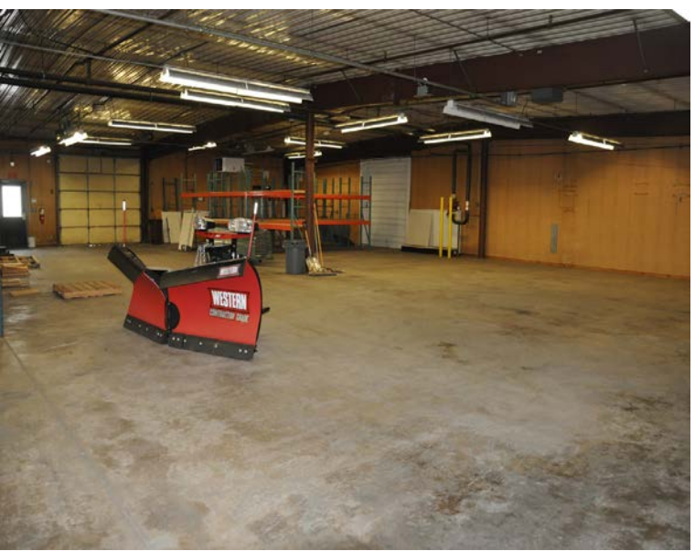
This information has been secured from sources we believe to be reliable, but we make no representations or warranties explained or implied as to the accuracy of the information. Buyer must verify the information and bears all risk for any inaccuracies.