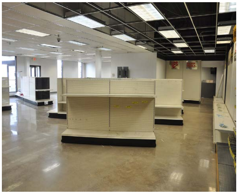
This information has been secured from sources we believe to be reliable, but we make no representations or warranties explained or implied as to the accuracy of the information. Buyer must verify the information and bears all risk for any inaccuracies.