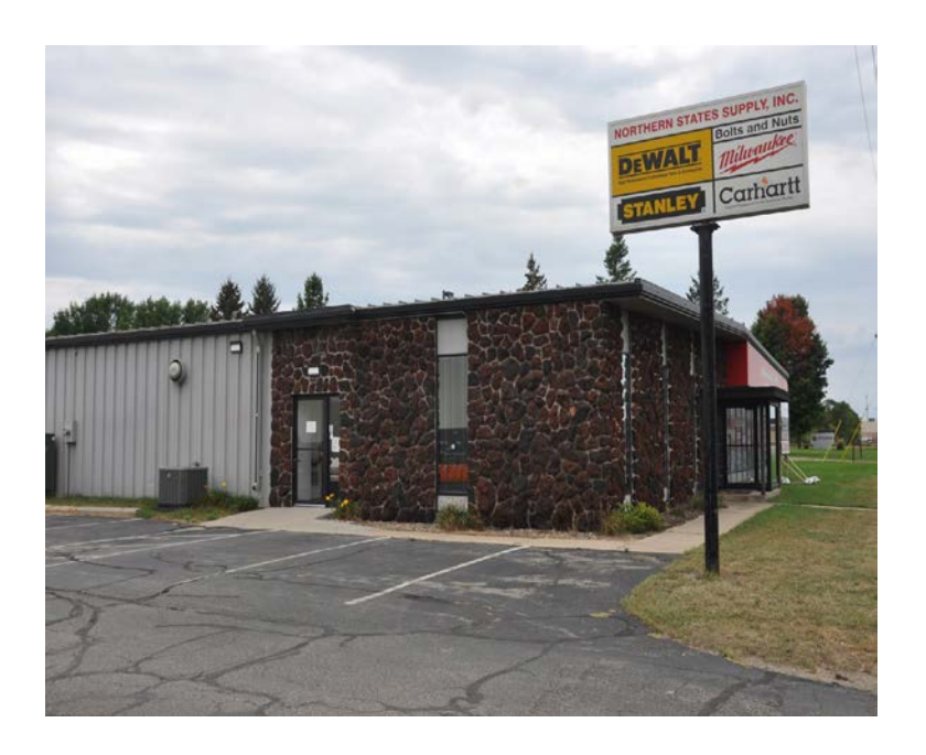
This information has been secured from sources we believe to be reliable, but we make no representations or warranties explained or implied as to the accuracy of the information. Buyer must verify the information and bears all risk for any inaccuracies.