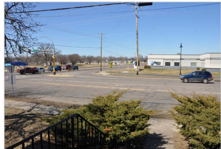
View from Front Door