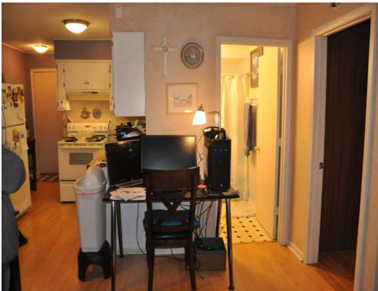
Apt. #3 (Owner Apt.)