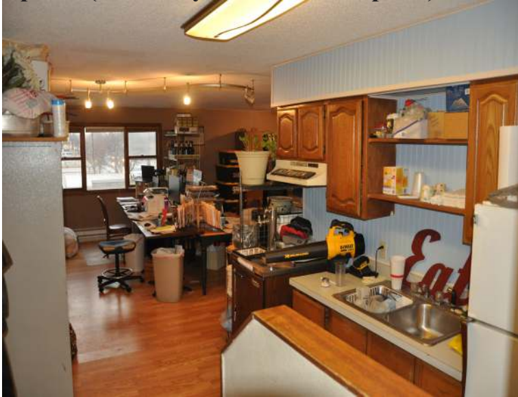
Apt. #1 (Currently used as office space.)